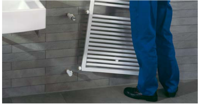
Retrofit model with recessed connections on side.

V20180723, RAD_DAS, SI_en, subject to change without notice