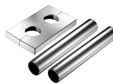
Set for 50 mm floor connection