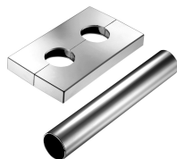
Set for 50 mm wall connection