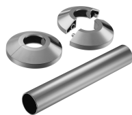
Set for standard wall connection