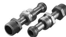
Connection pipe set

The connection sets complete the elegant and modern design of Danfoss X-tra Collection™ products in combination with towel rails and designer radiators.